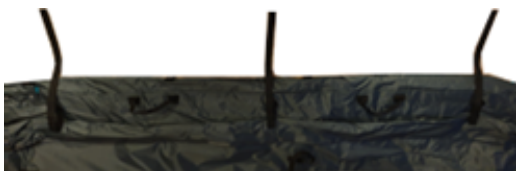
Image showing 3 of 6 straps. All 6 straps should be fastened

Ensure when fixing the mattress to the bed the security straps are only fitted to the moving parts of the mattress platform.