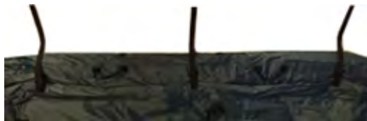
Image showing 3 of 6 straps. All 6 straps should be fastened

Ensure when fixing the mattress to the bed the security straps are only fitted to the moving parts of the mattress platform.