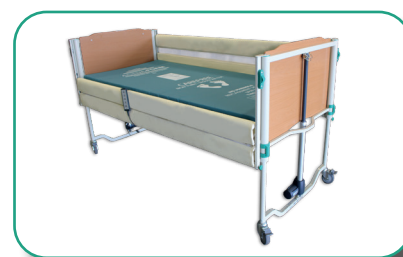
Full length mesh bumpers

The Cura II can be complemented by easily extendable full length telescopic or 3/4 length folding 4-bar side rails.