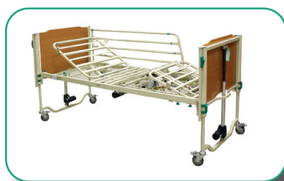
3/4 folding 4-bar side rails