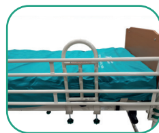
UBEB7004-3 in conjunction with full length extending side rails