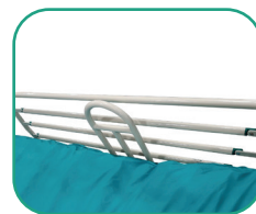
UBEB7004-3 in conjunction with 3/4 length side rails