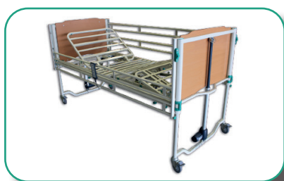
Full length extending side rails

The mattress platform can be easily extended in situ by 200mm without the need to disassemble the bed. Thus offering maximum flexibility of care and providing a safe comfortable experience for taller patients.