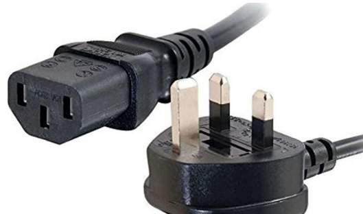
3 Prong Plug - UHSUPRA0173-3

Heritage II Bariatric 3 Prong Plug – Up to Serial Number 7809414680