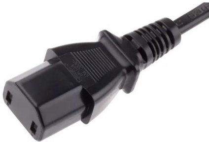
2 Prong Plug - UHSUPRA0277