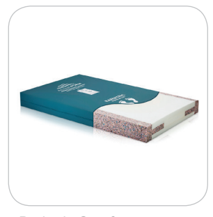
Bariatric Carefree mattress