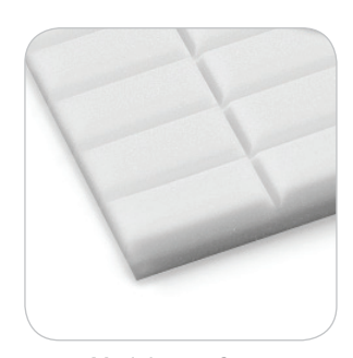
Modular cut foam